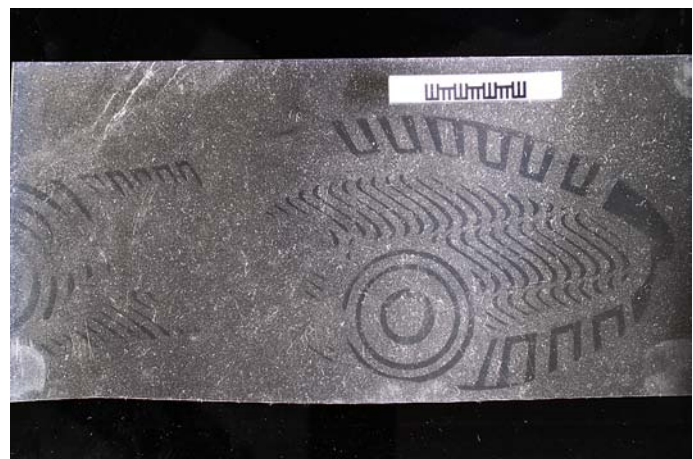
Dark-field imaging of a dust track