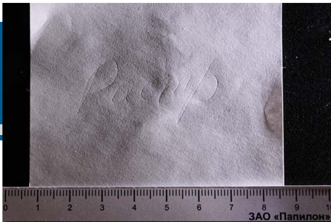
Indented writing restoration