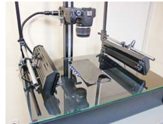
Dark-field box. Before the sample is illuminated with fill-in light