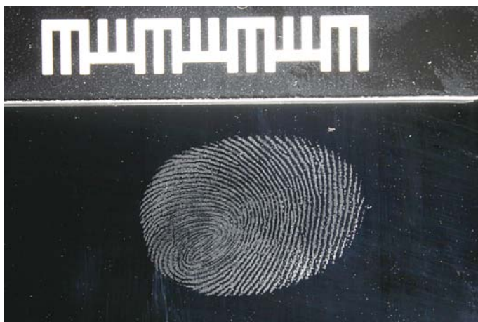
Dark-field illumination of undeveloped latent using the dark-field box